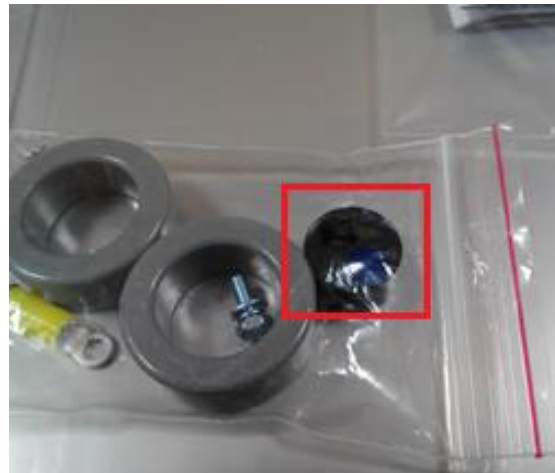
Picture 2 cable gland